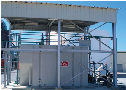
Factory-Built ADDIGEST® WWT Plant

Flow Capacities: 1,000 GPD - 125,000 GPD