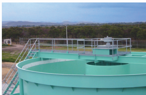
CLAR-I-VATOR® Solids Contact Clarifier