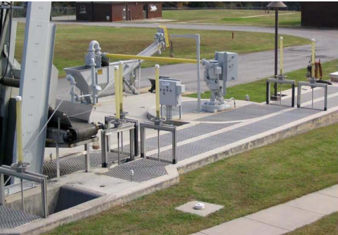
PISTA® Grit Removal System