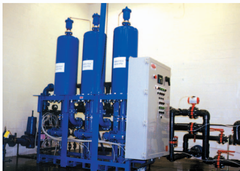
FIBROTEX® Fine Particle Filter