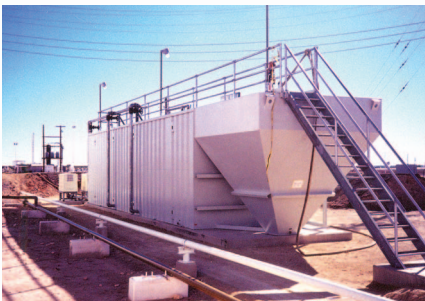
Factory-Built FAST® On-Site Treatment System

Flow Capacities: 2,000 GPD-100,000 in a single train