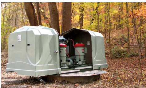
FORMULA X® Wet Well Mounted Pump Station