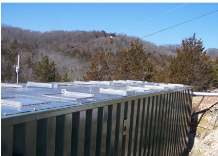
BioFicient® Aeration System

The BioFicient pre-engineered treatment system reduces biosolids wasting and handling requirements through the use of a Bio-Reducer zone and a series of Calorie Reducer zones.