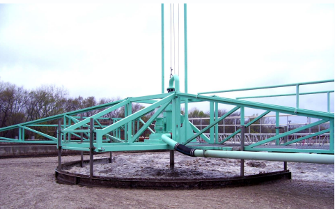
BIOMIXER® Wastewater Treatment System