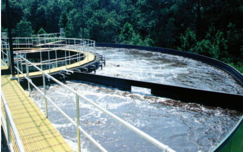
Model R OXIGEST® Treatment System

Flow Capacities: 75,000 GPD - 5 MGD (single unit)