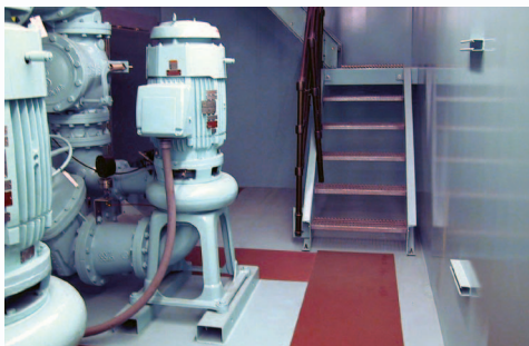
CAPSULAR® Pump Station

VISIT US ON THE WEB OR CALL US TODAY TO LEARN MORE ABOUT OUR PUMPING & TREATMENT SOLUTIONS!